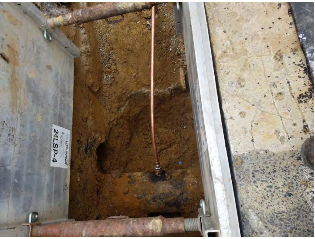
Institation of New Water Service Line into 12" Watermain

CONSTRUCTION MANAGER'S WEEKLY PROGRESS REPORT WEEK ENDING 4/27/2019 PAGE 6 of 7