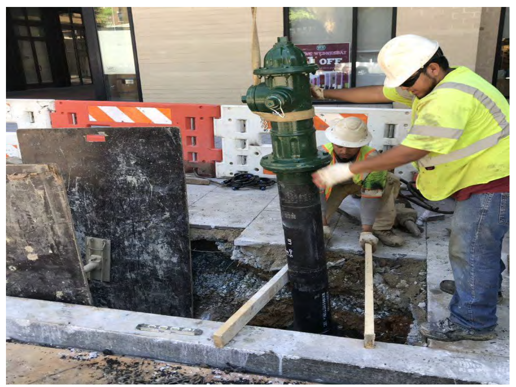
Installation of New Fire Hydrant between V Street and W Street

CONSTRUCTION MANAGER'S WEEKLY PROGRESS REPORT WEEK ENDING 4/27/2019 PAGE 7 of 7