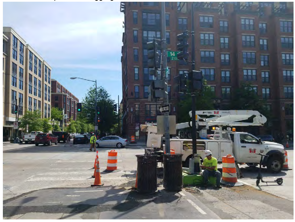
Wiring of Temporary Traffic Signal