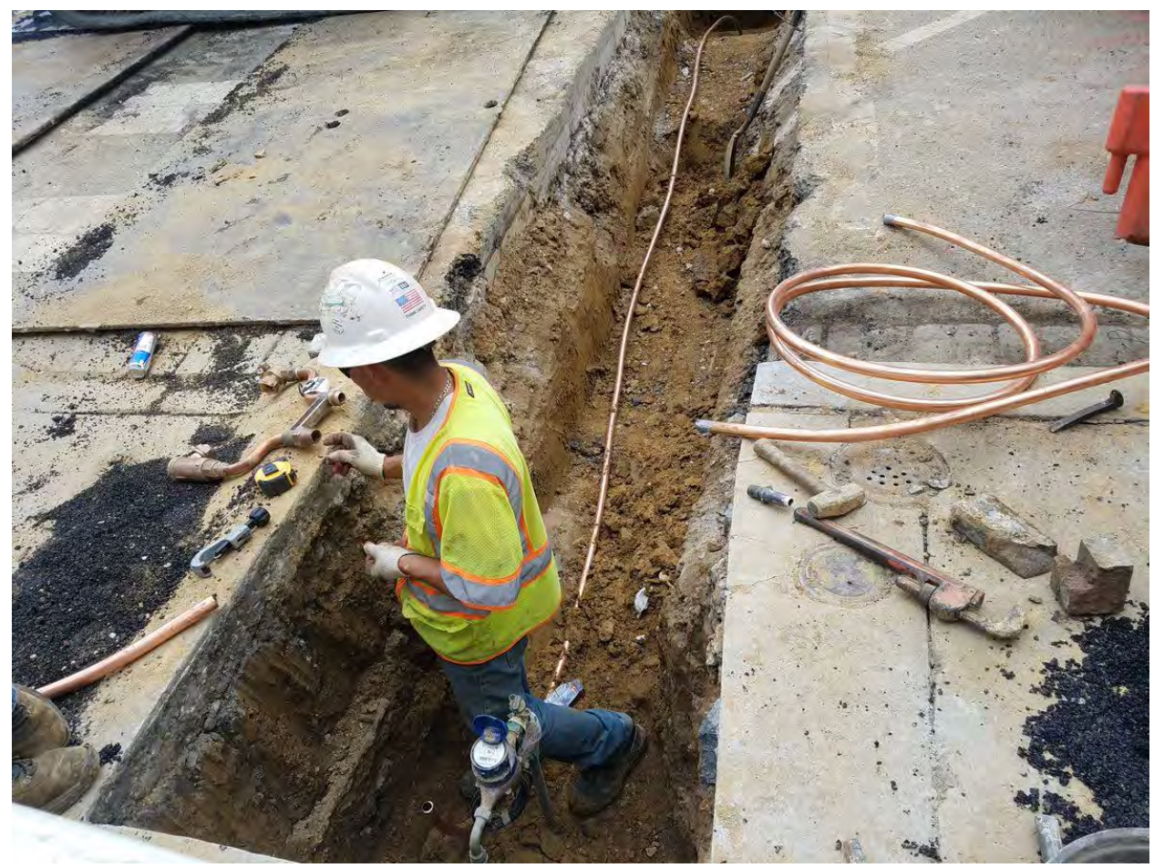
Installation of 2" Water Service Line between R Street and Street

Project Website: www.14thstreetproject.com