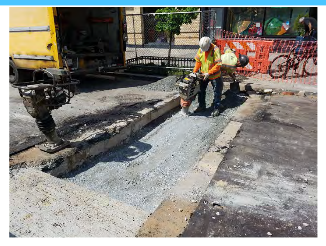
Compaction of Aggregate Base Material over Water Service Line