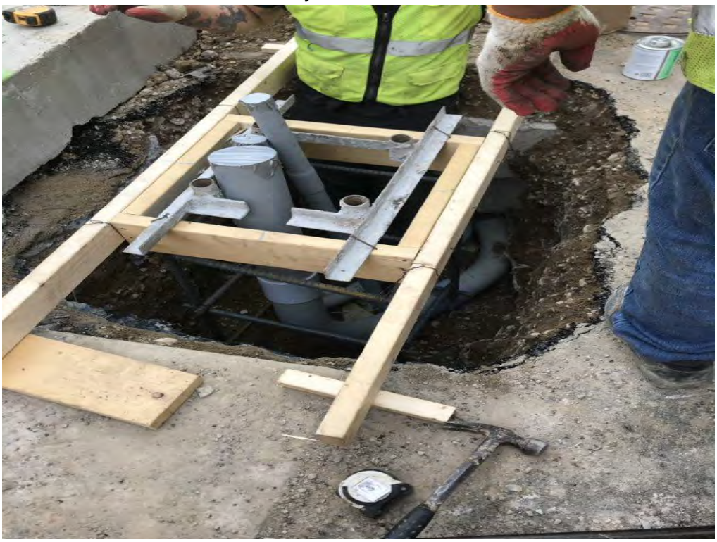
Formed Traffic Signal Foundation at the NE Corner of 14th and V Street