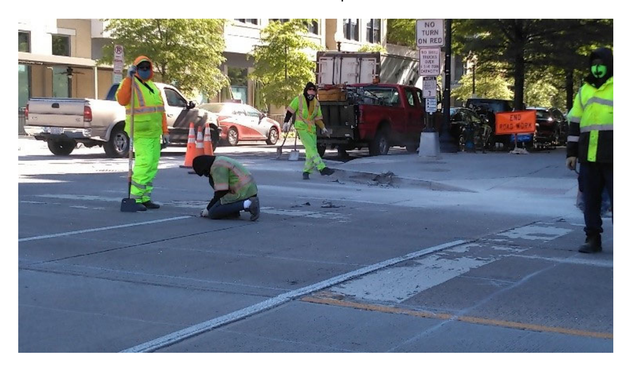
DCLine removing temporary tape at W street