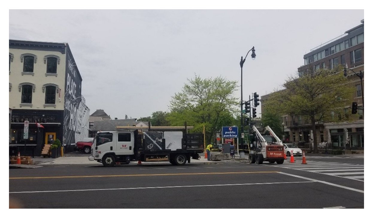
Inlet was delivered to the SWC of S Street