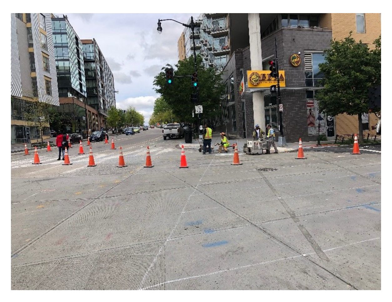
DC Line removing old lane marking