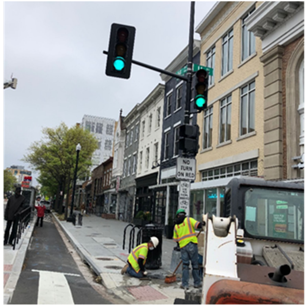
FMCC patching sidewalks at s/w/c of U & 14th street