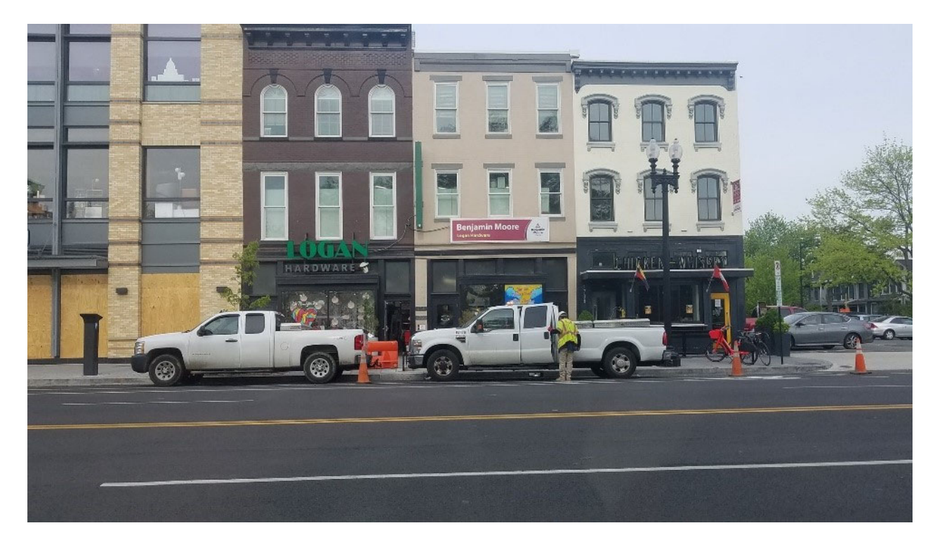
FMCC was on site for some punchlist work items