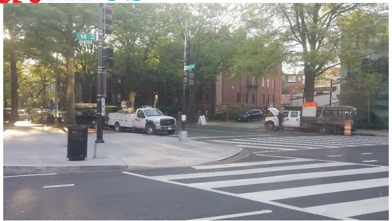
DEN was on site working on punch list items