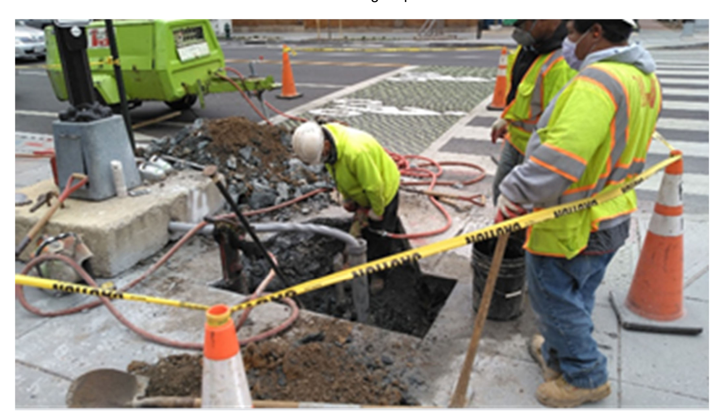
Demo and removal of cracked foundation Q Street