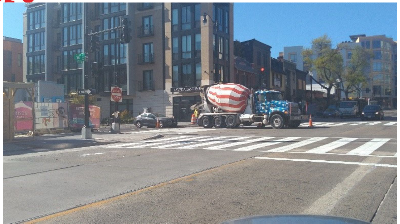
FMCC restoring sidewalk after T-base removal