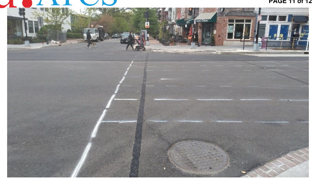
Layout Q street Striping