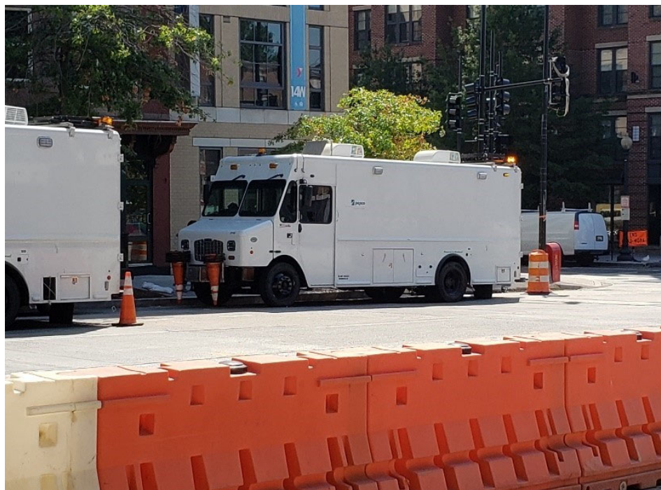
Pepco Crew worked at 2 various locations on 14 th St. NB between W St. and Florida Ave. and SB between Swann St. and R St. on 14 th .