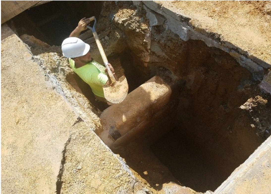
Hand excavation near existing utility duct bank.