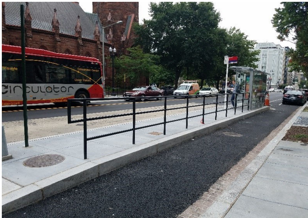
Pipe Handrail installed at bus island at SWC of 14 th & N St