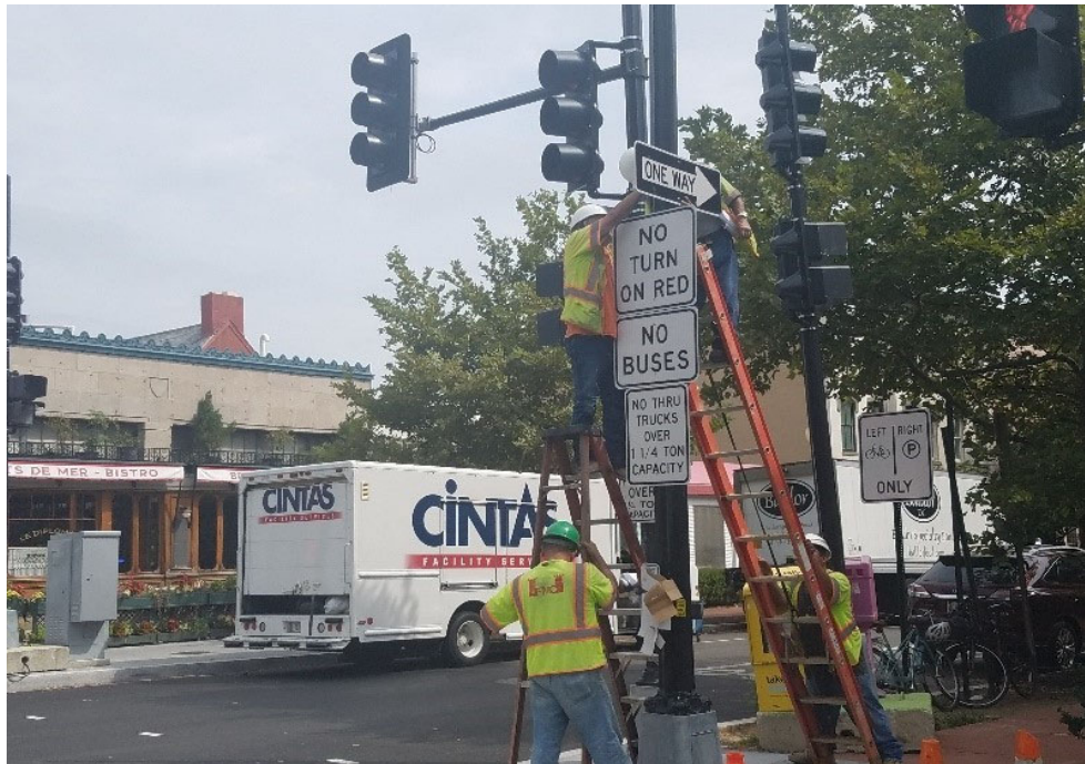
Installation of signs at SEC of 14 th & S St