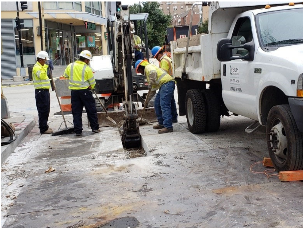
PEPCO Contractor Stealth Const. run a new wires, conduits 4" PVC Sch. 40 from abandoned MH.on 14 th St.