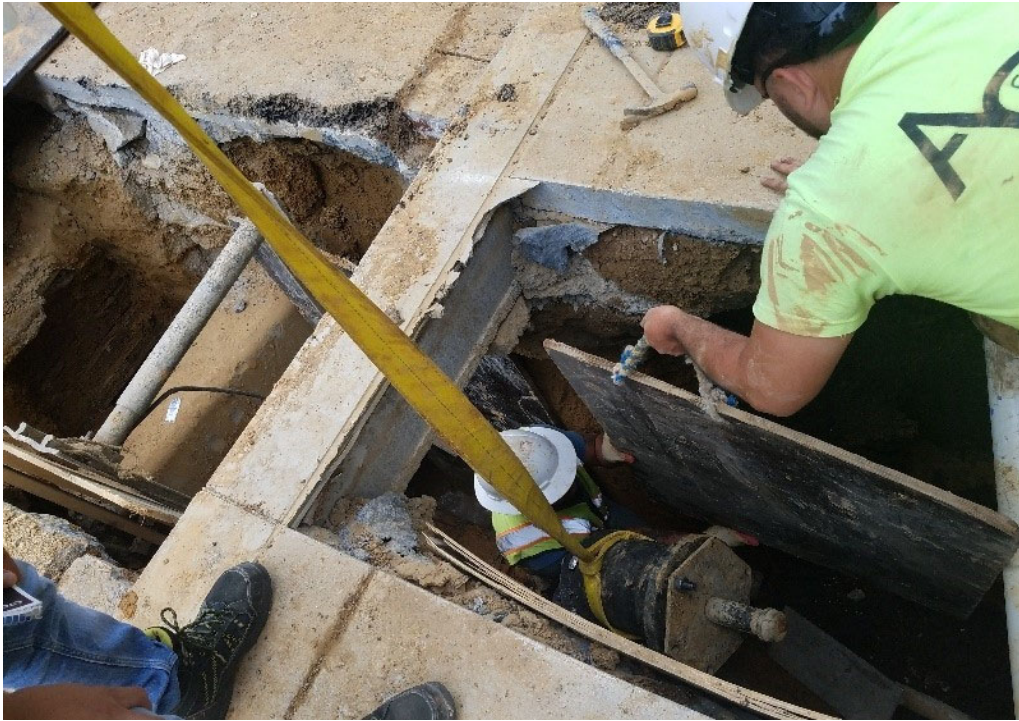
Plug installed at 8" main at close of work day by Omni.