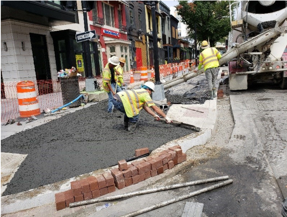
D.E.N placed 9 CY Class F, DC-DOT 3500 PSI Concrete for PCC Sidewalk.