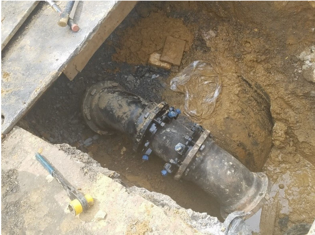
45° 8" DIP fitting at trench crossing R St