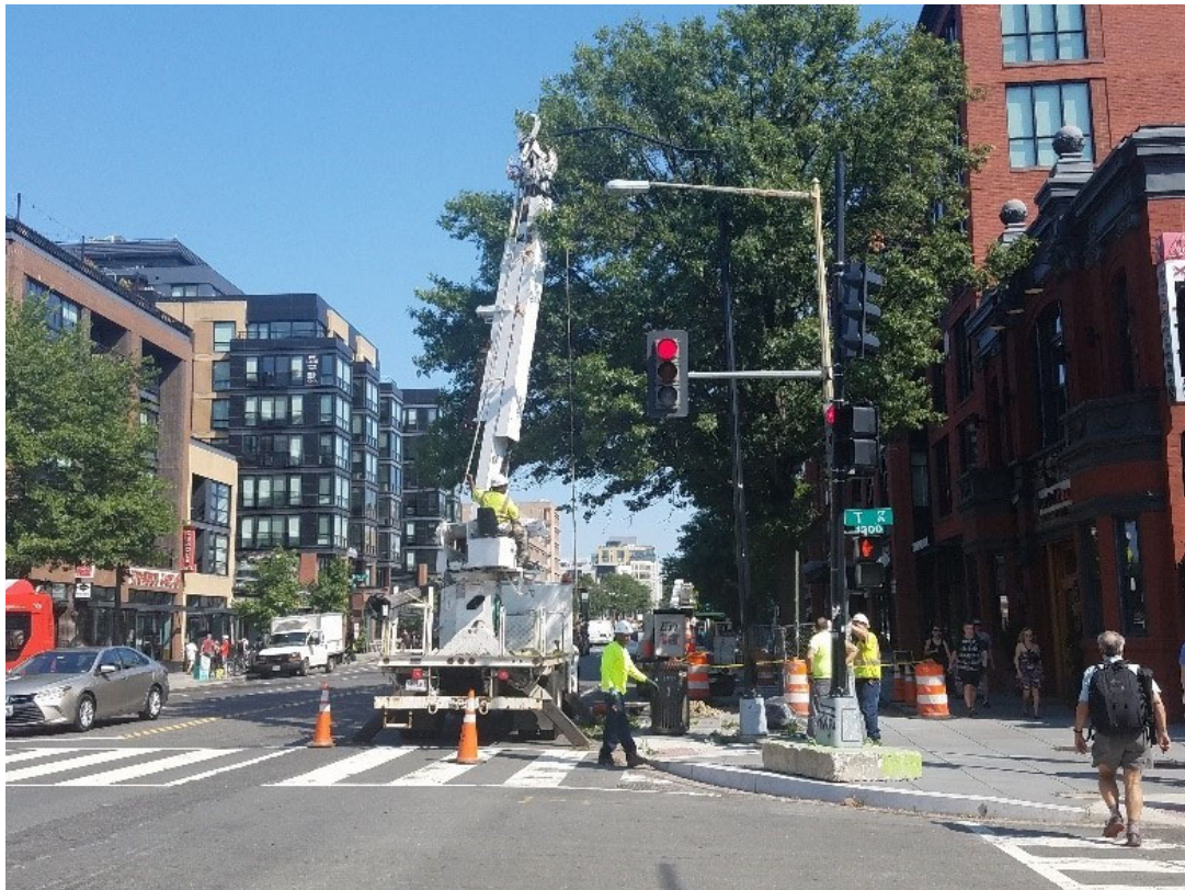
28' Pole L88/PP installed by FMCC Electric crew