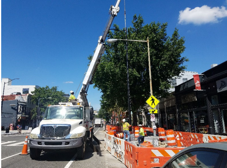
28' Pole L80/PP installed by FMCC Electric crew