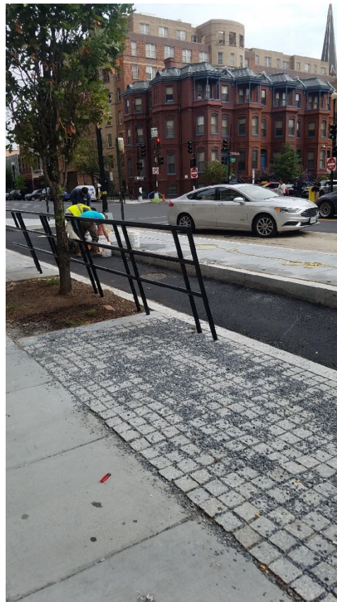
Long Fence installing handrail at the N street Bus Island