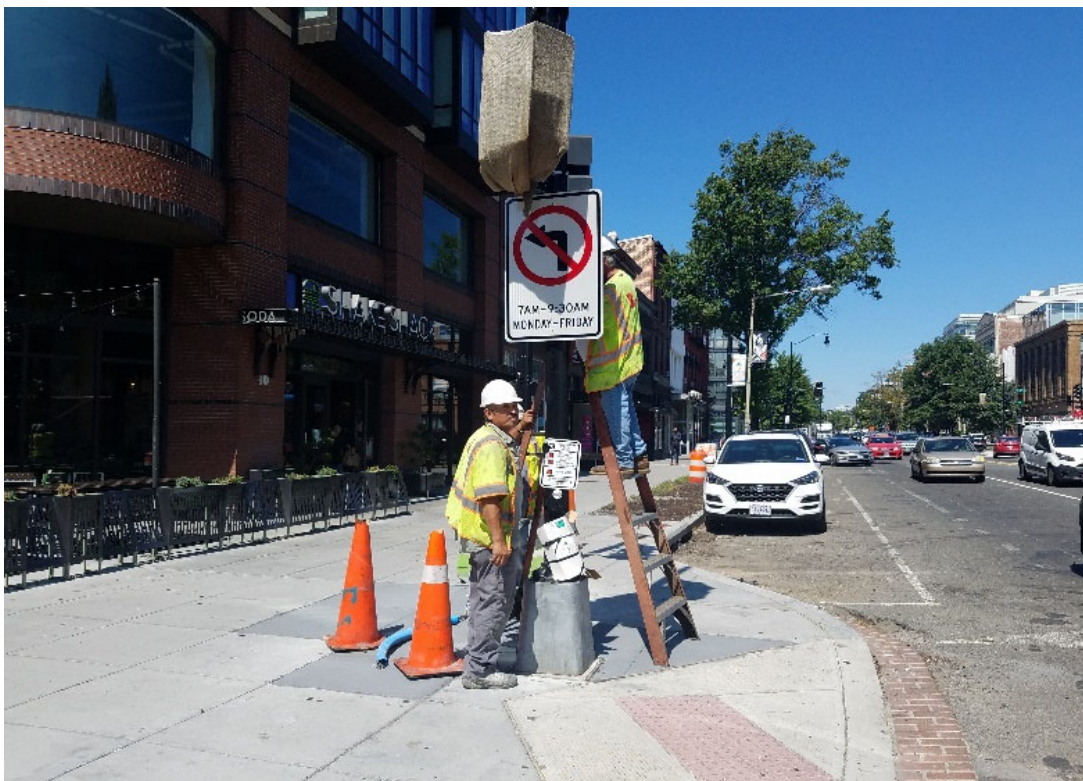
New traffic signs installed by FMCC at NWC of 14 th & RIA