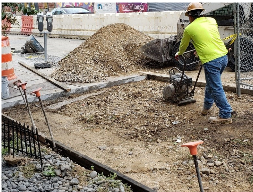
D.E.N crew excavated; then placed Borrow Embankment & GAB at 1405 for PCC-Sidewalk.