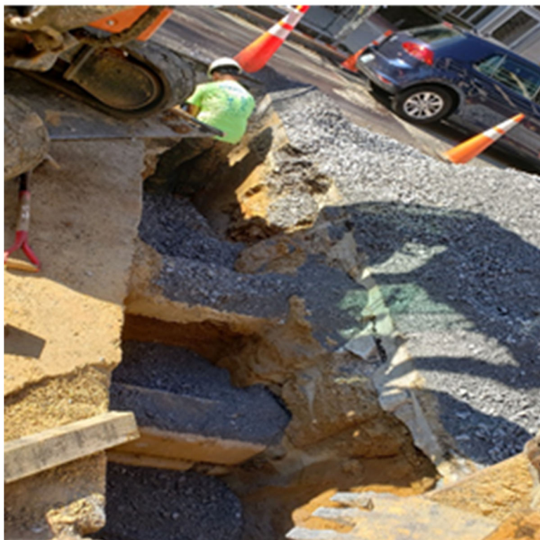
OMNI, Inc. Crew Back-filled & Compacted the Water-Main Trench with CR-6 #200 Stone; at 14 th & R St.NW.