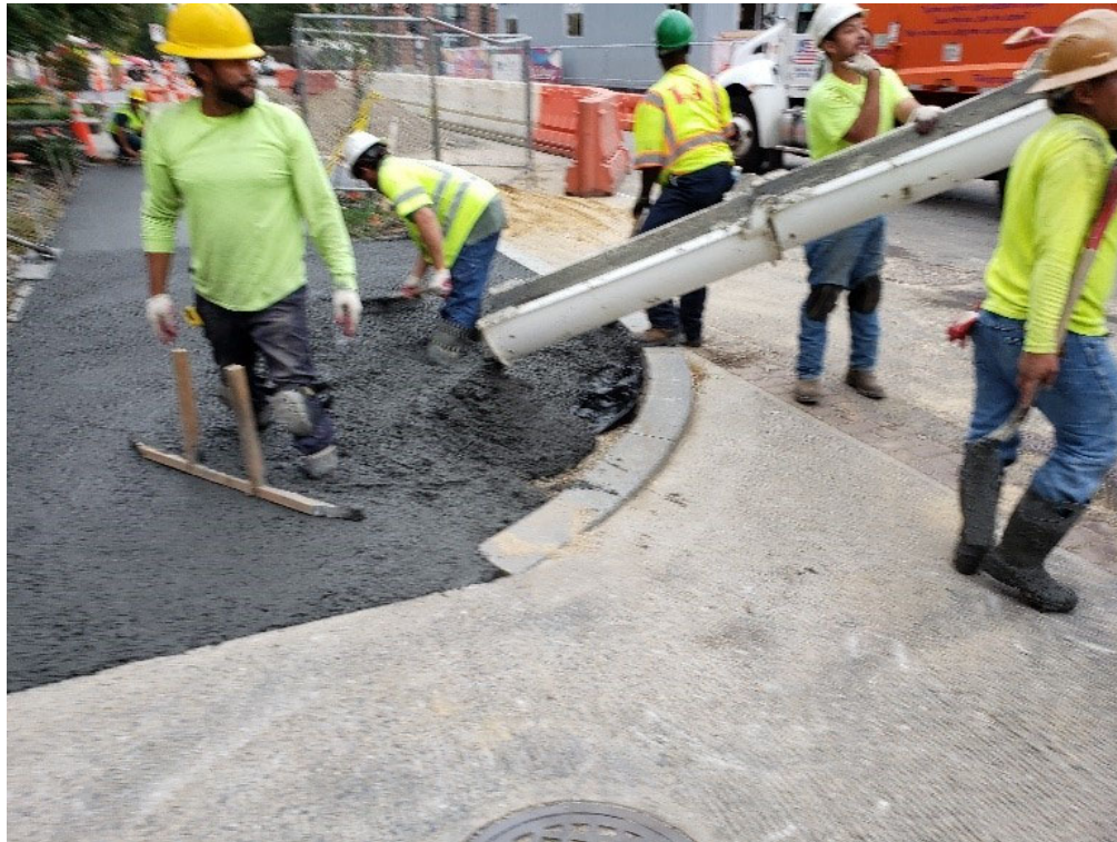
DEN Placed PCC Sidewalk in fronty of 1405 Condo Bldg, a total of 7 C.Yds, Class F Concteter placed.