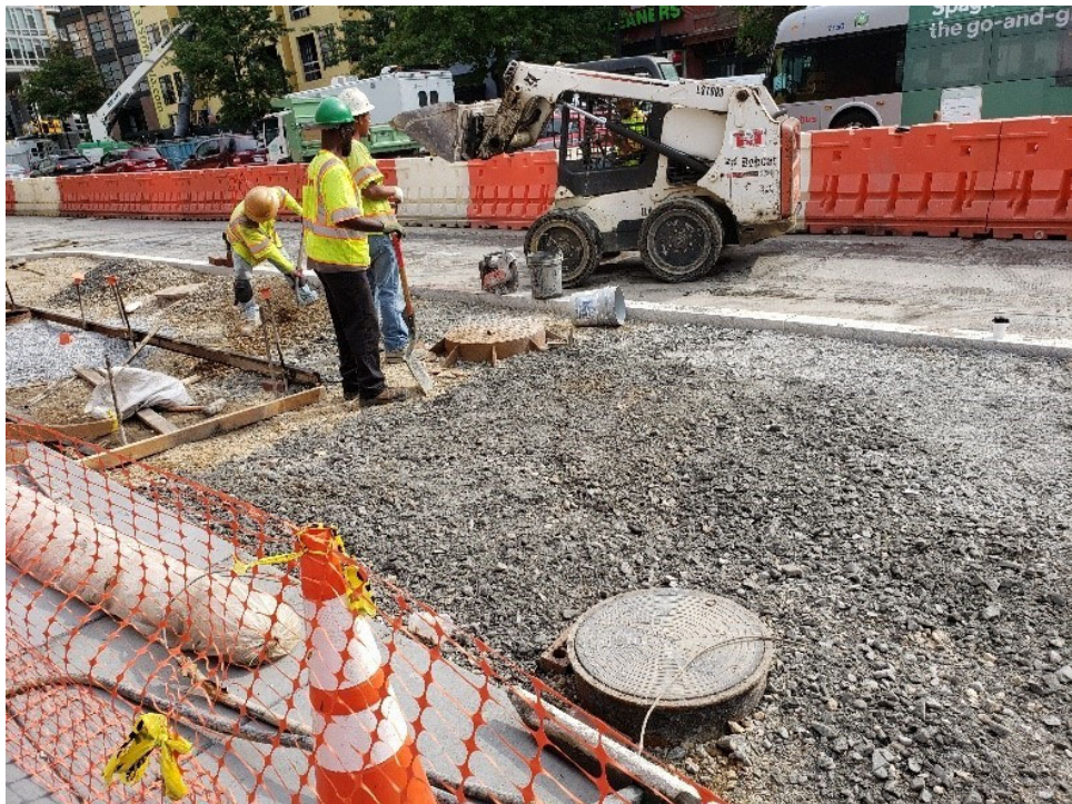
DEN crew placed Burrow Embankment, topped with GAB 4" & compacted prior to placement PCC Sidewalk.