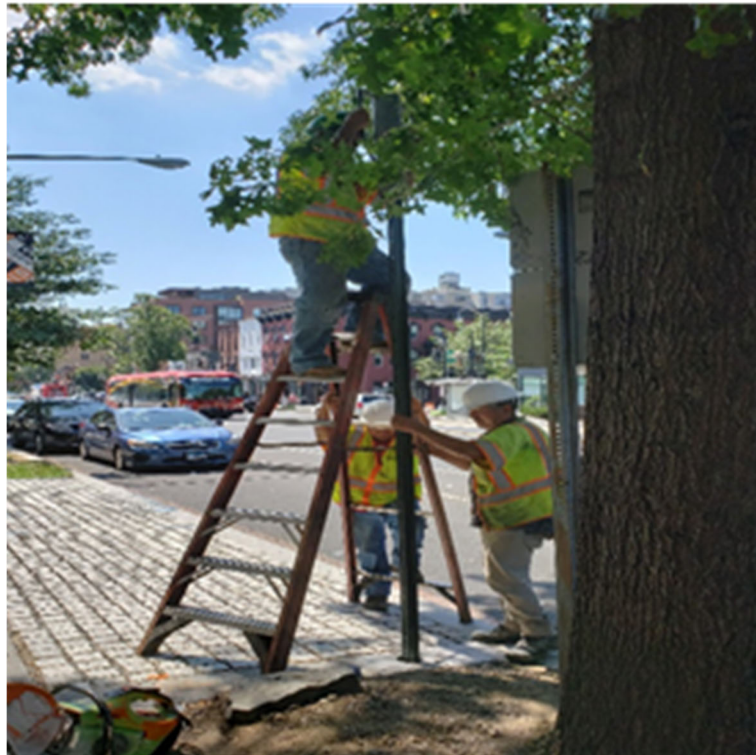
FMCC crew Core Drilled and Installed a total of 19 Signs Poles from P to Q St. in NB & SB Directions.