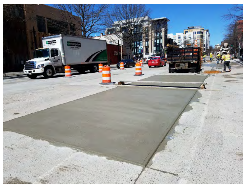
PCC Pavement Repair between Florida and W Street