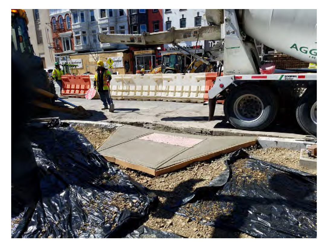
ADA Ramp at the NE Corner of 14th and Riggs