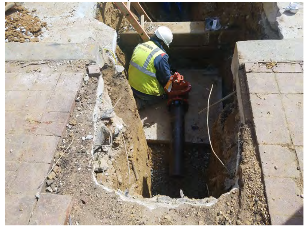
Installation of Gate Valve for New Fire Hydrant at 14th and U Street