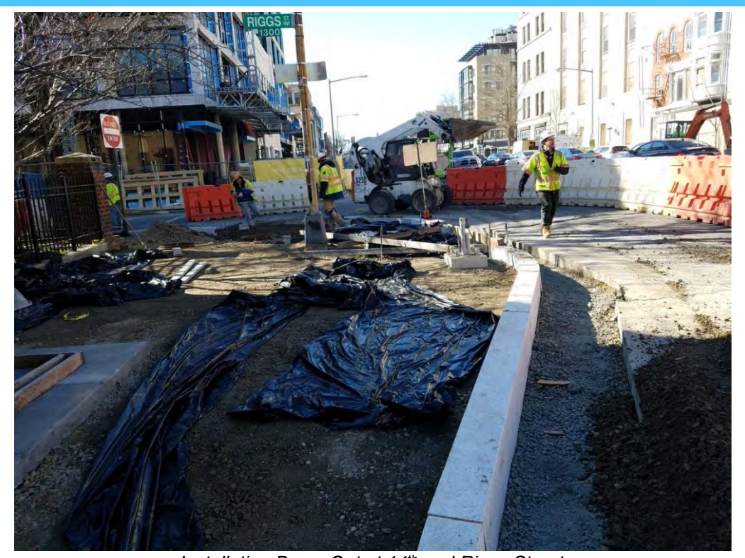
Installation Bump Out at 14th and Riggs Street