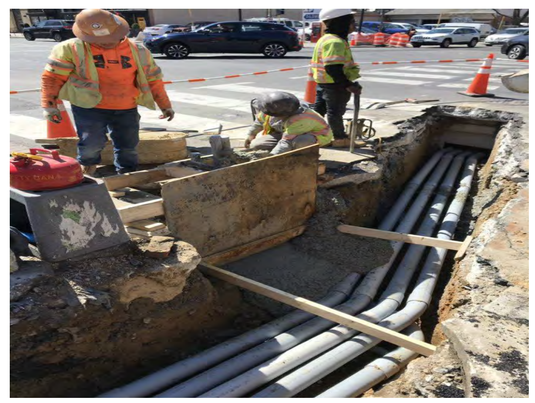
Installation 2" and 4" PVC Electrical Conduit