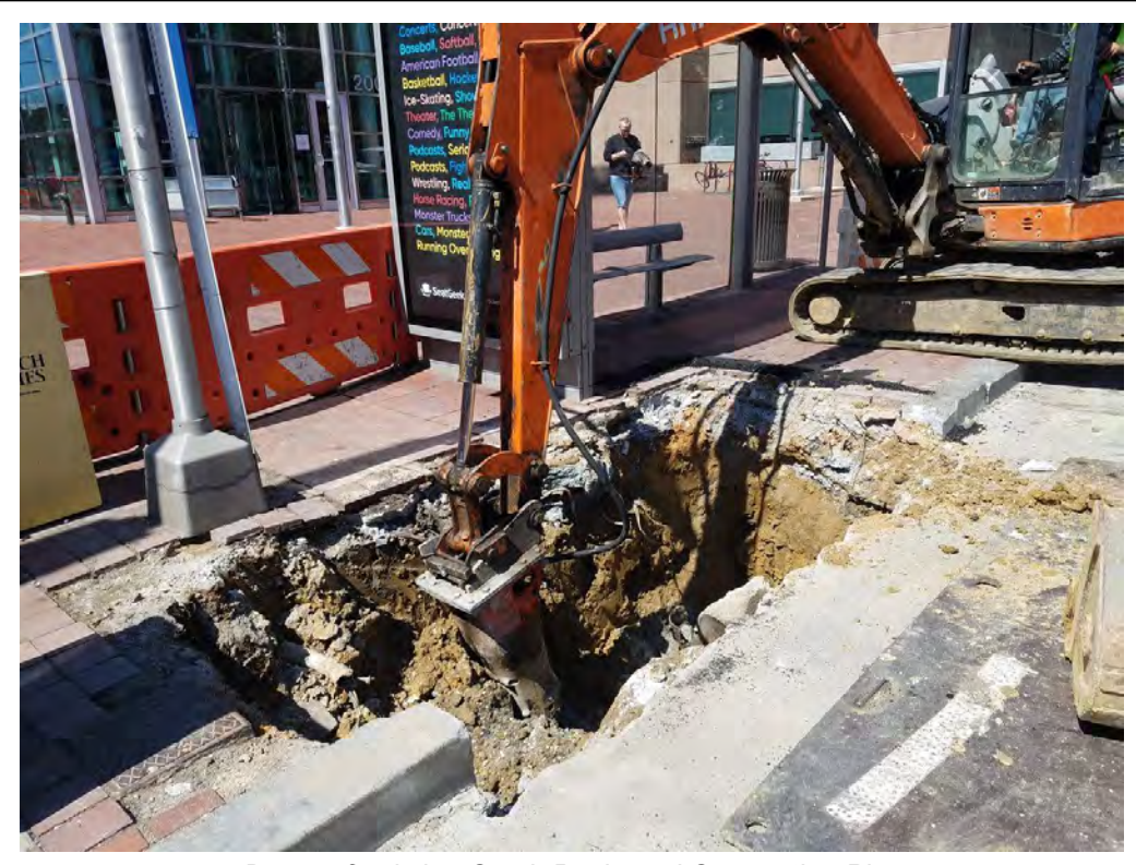
Demo of existing Catch Basin and Connection Pipe