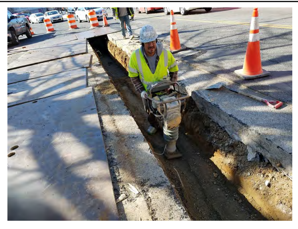
Compaction of Backfill Material over encased PVC Consuit