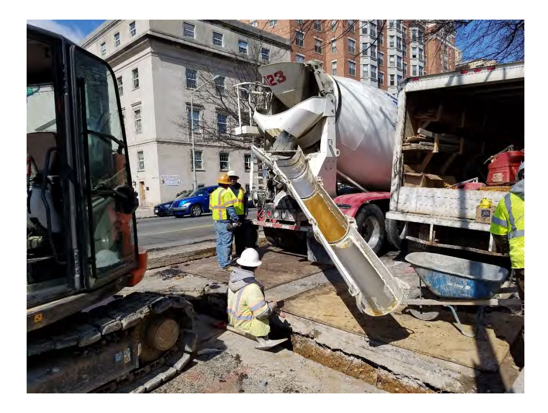
Placing PCC Concrete for encasement of PVC Conduit