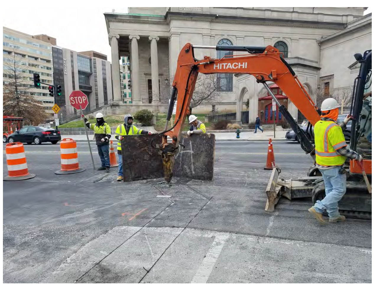
Demoliation of pavement for conduit installation between Thomas Circle and N Street on the Eastside

Project Website: www.14thstreetproject.com