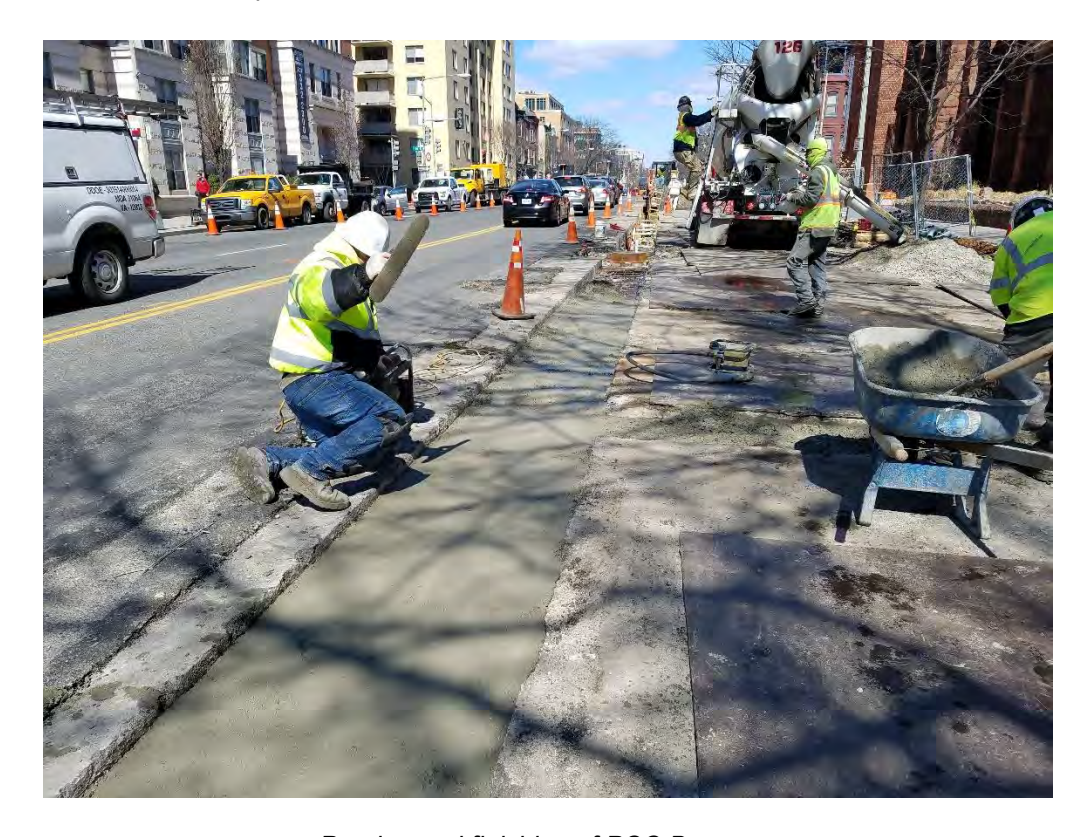
Pouring and finishing of PCC Base