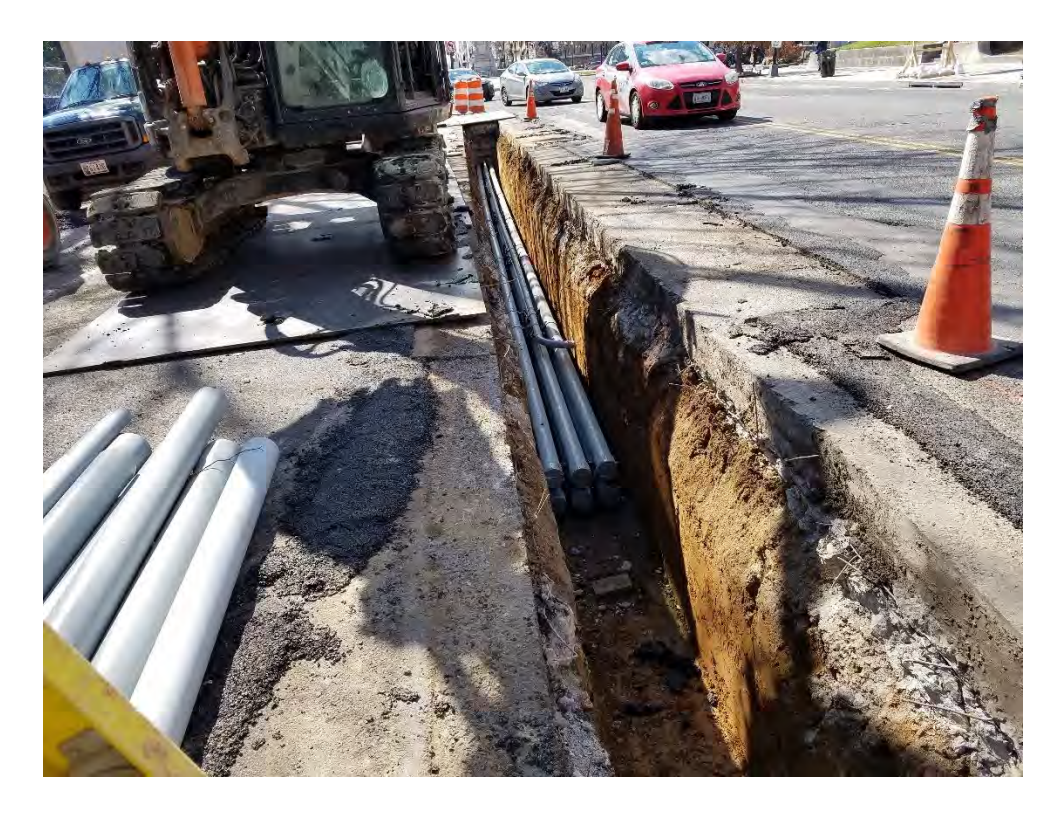
Installation of 6-4" and 1-2" PVC Conduit