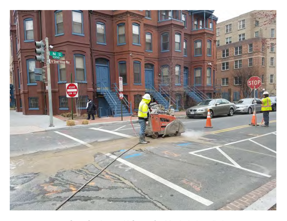
Saw-Cutting on N Street for Manhole installation