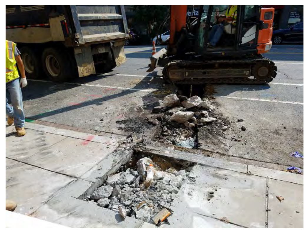
Excavation of Lateral and Street Light Foundation between P Street and Church St.