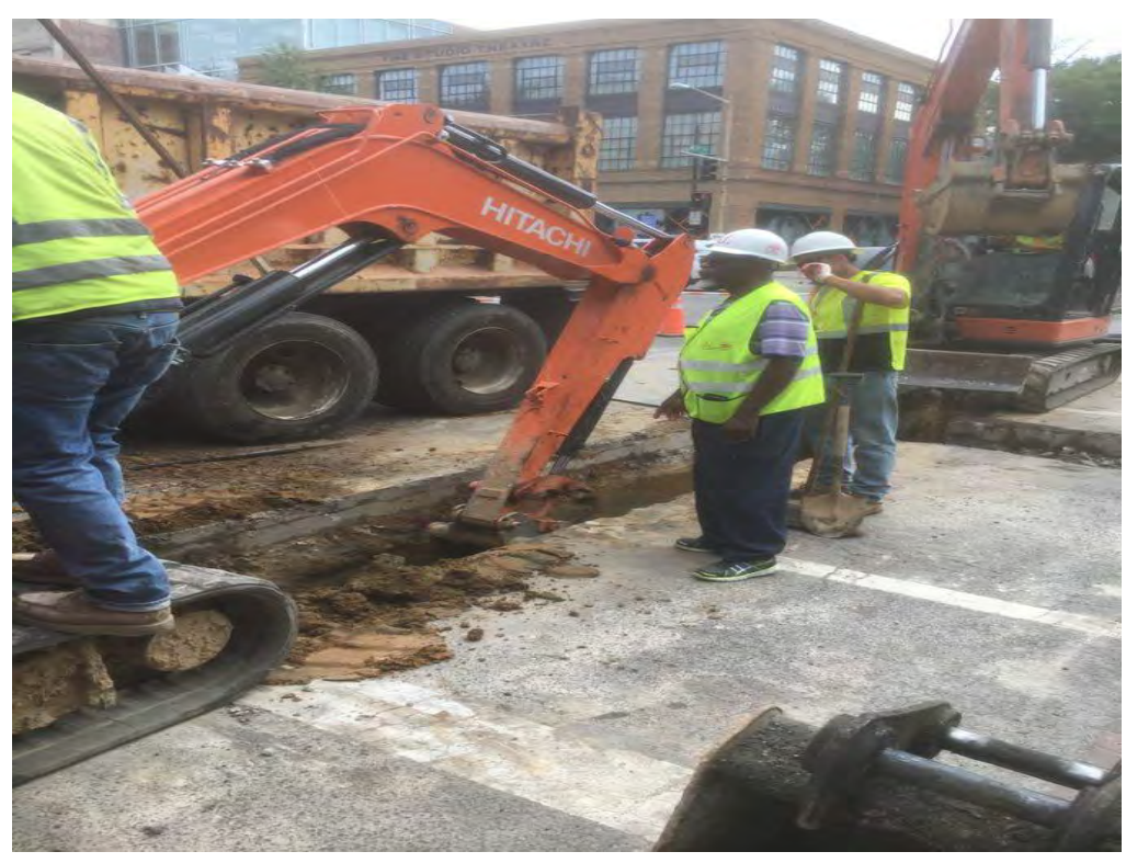
Excavation for 4" and 2" PVC Conduit at the intersection of 14th and P Street