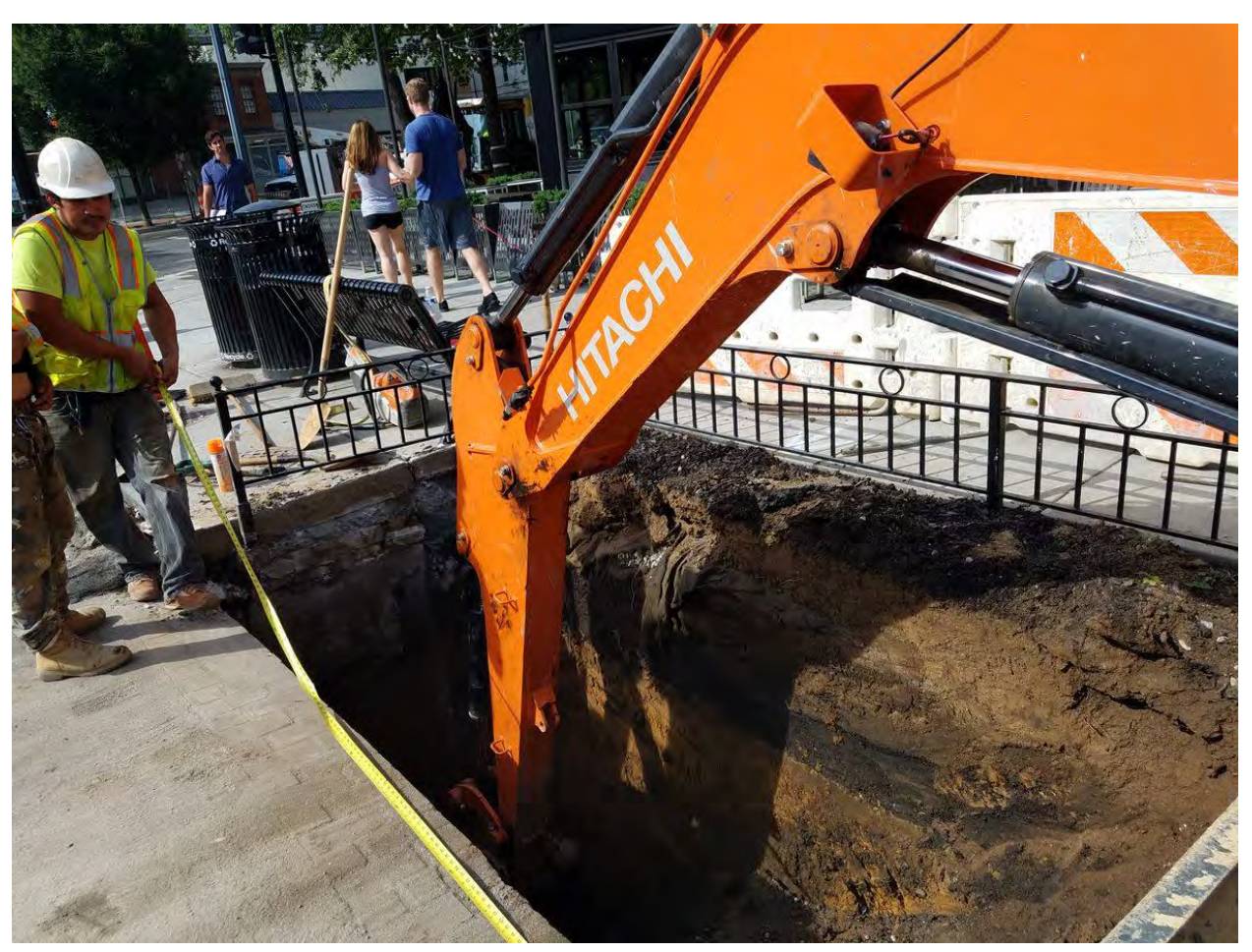
Excavation for Double Catch Basin at Rhode Island Ave on the Westside

Project Website: www.14thstreetproject.com