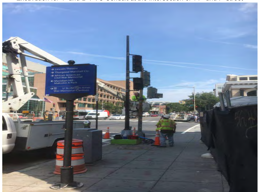
Placement of Temporary Traffic Signal at the NE Corner of 14th and U Street