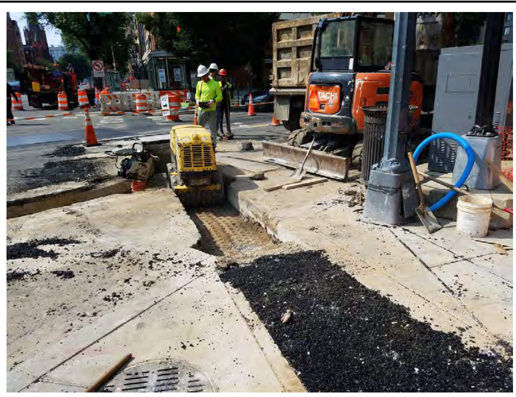
Compaction of RC-6 material at the NW corner of P Street