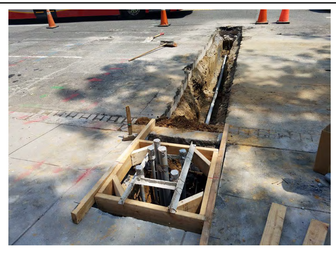
Installation of new Streetlight Foundation between P Street and Church St.