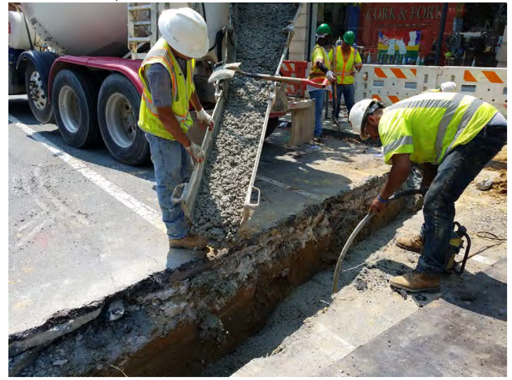
Encasement of 2" PVC Conduit for Lateral between P Street and Church St.