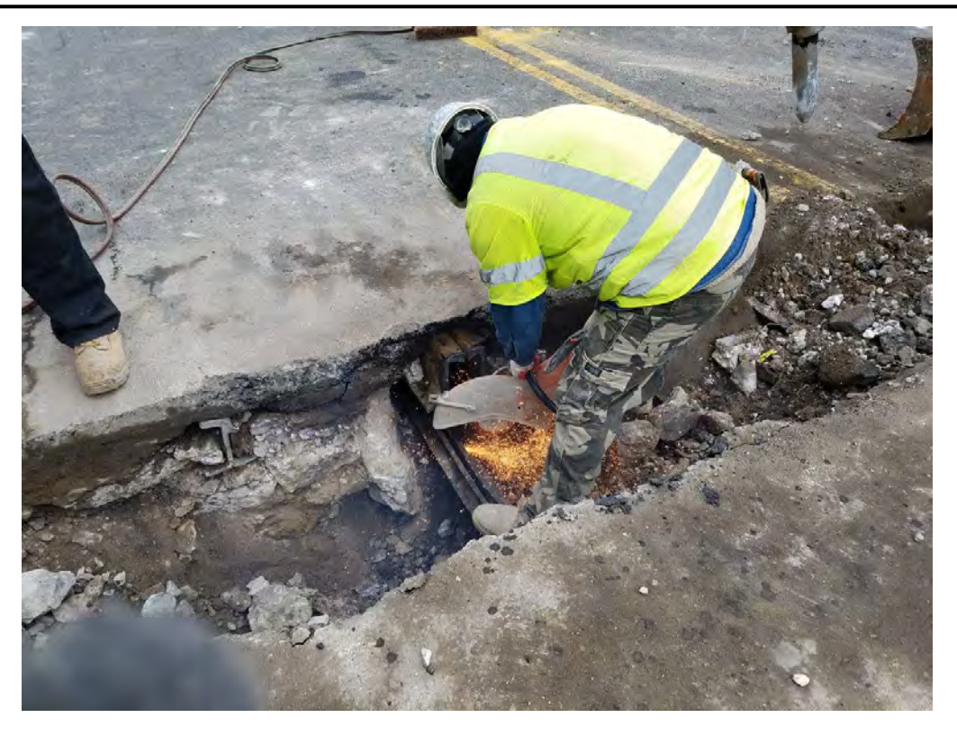
Removal of Street Car Tracks between Swann and T Street