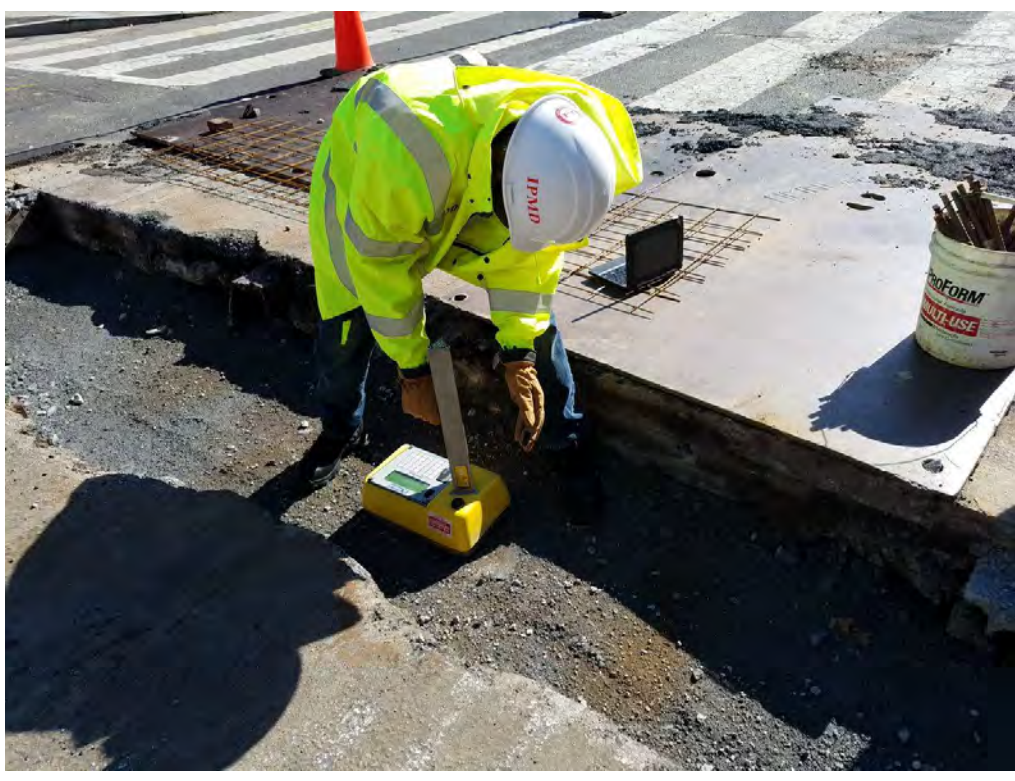
QA/QC testing Aggregate Base Material prior to PCC Base placement