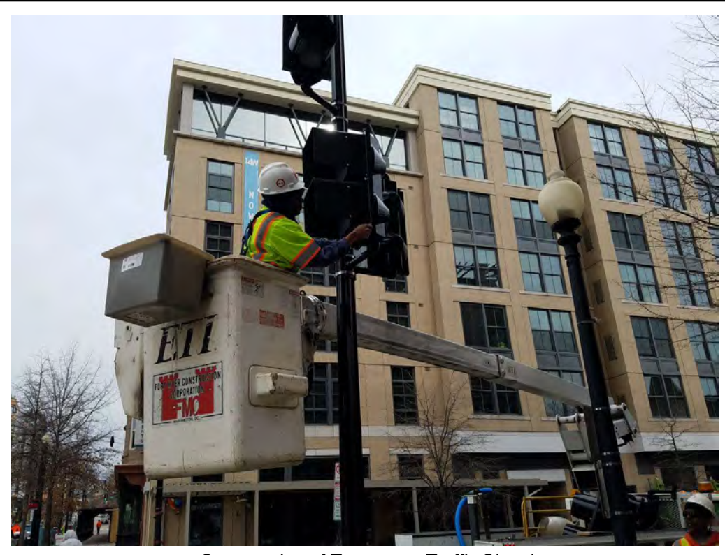
Construction of Temporary Traffic Signal