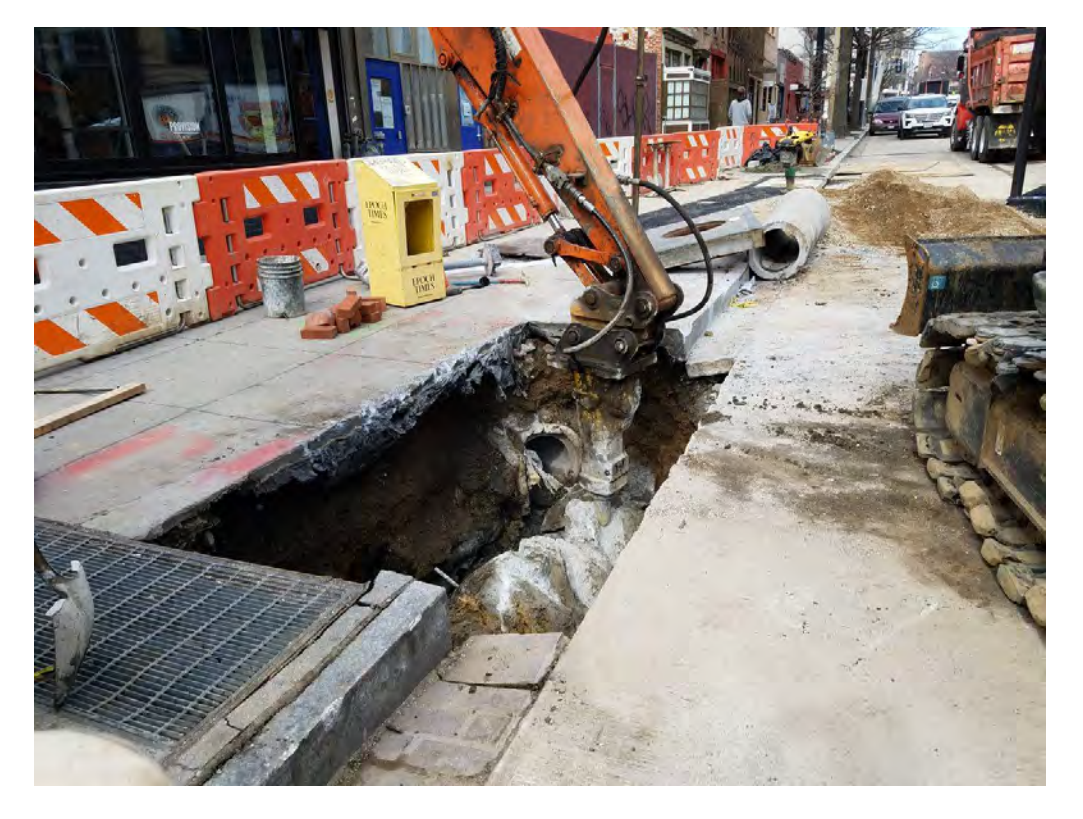
Abandonment of existing catch basin at 14th and W Street