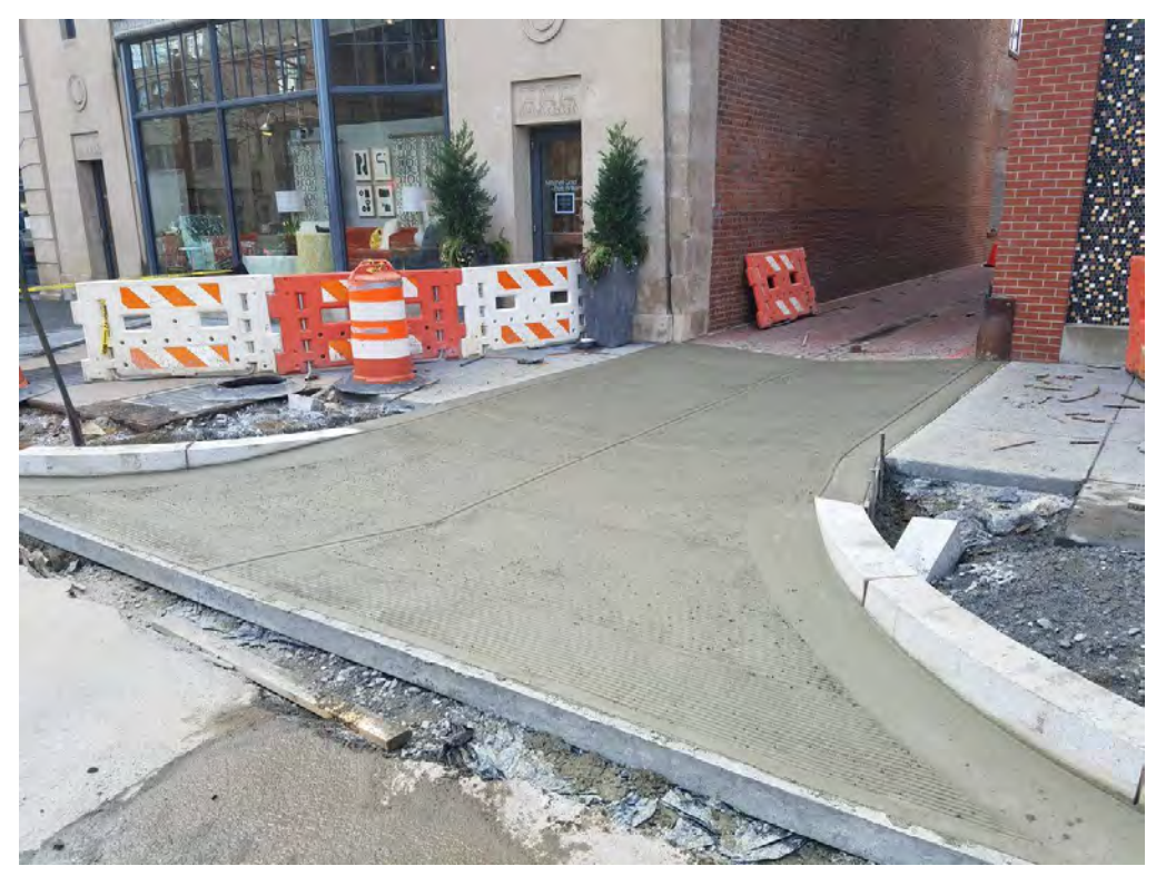
New Driveway Entrance between Church and Q Street