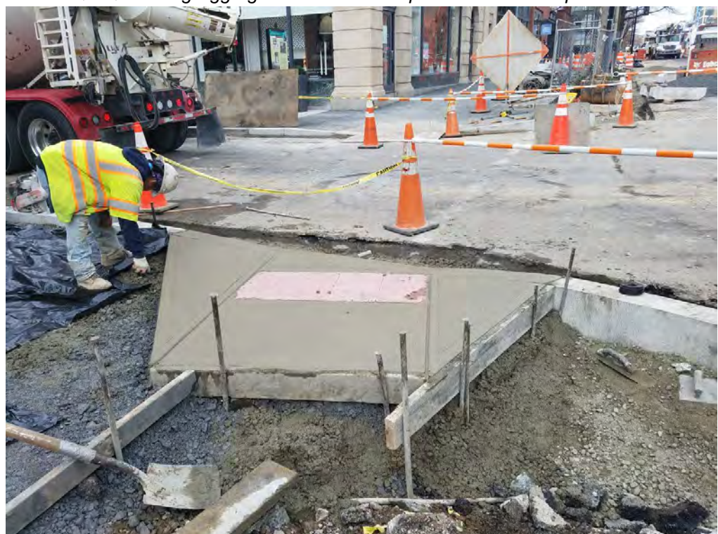
Installation of ADA Ramp at SW Corner of Church Street